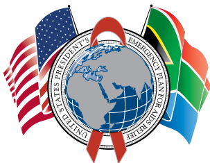
SOUTH AFRICANS AND AMERICANS IN PARTNERSHIP TO FIGHT HIV/AIDS