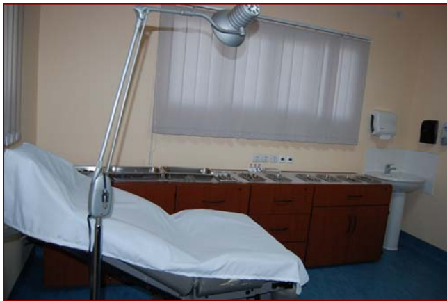
The UCM clinic provides much-needed HIV treatment and other health services to people in Sofala Province.

With support from PEPFAR through CDC/Mozambique, UCM has been collaborating with the University of Pittsburgh since 2006. While the clinic site was undergoing lengthy renovations, partners focused on faculty and curriculum development through an extensive series of professional exchanges and trainings conducted in both Mozambique and the United States.